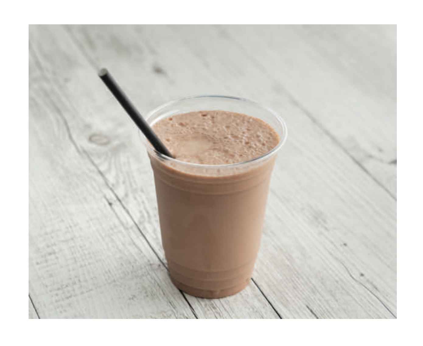
CHOCOLATE FUDGE $8.50 CHOCOLATE GANACHE BLENDED WITH FULL CREAM MILK & ICE-CREAM