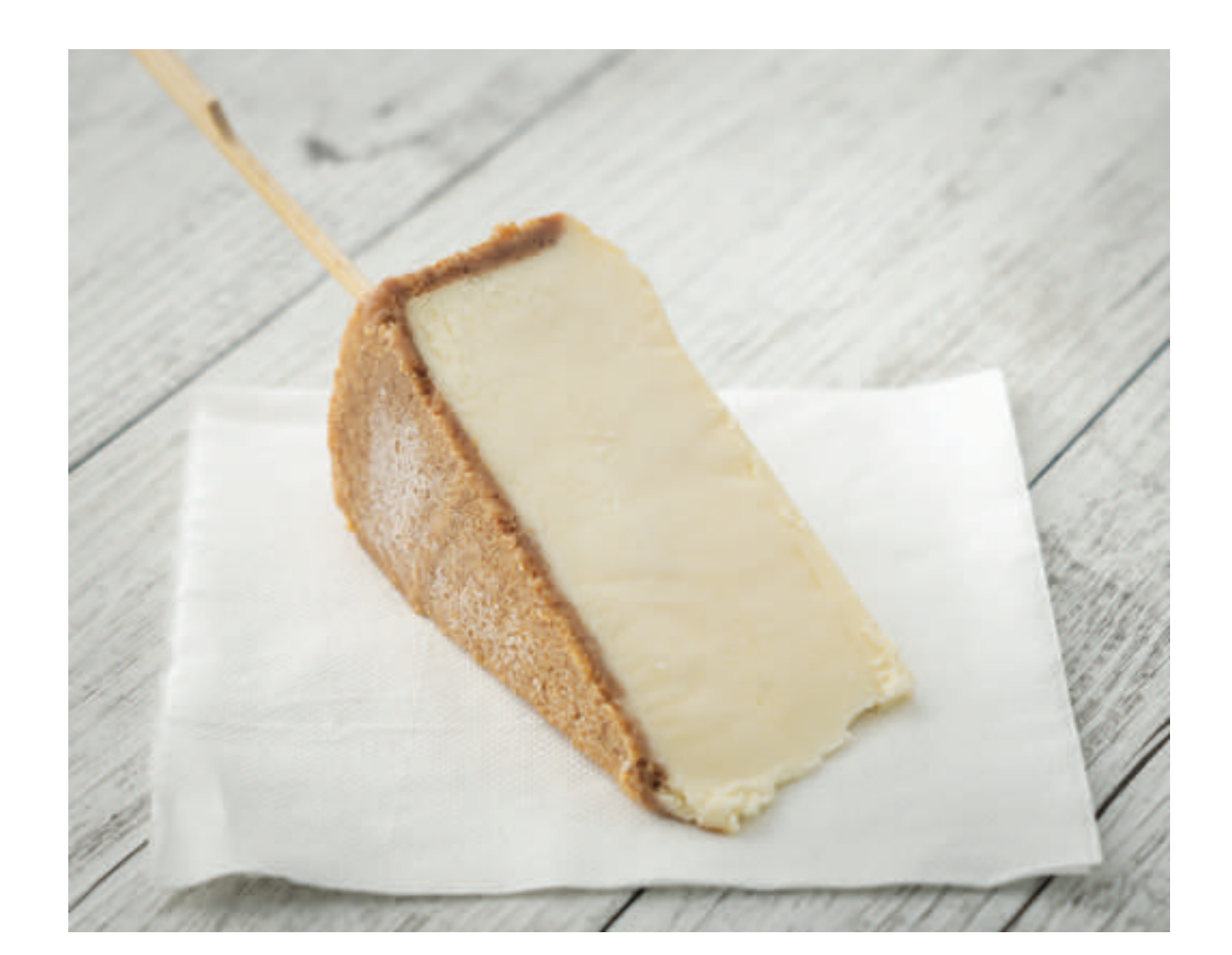
NEW YORK STYLE $9 A CLASSIC CREAMY CHEESECAKE WITH A BISCUIT CRUMB BASE