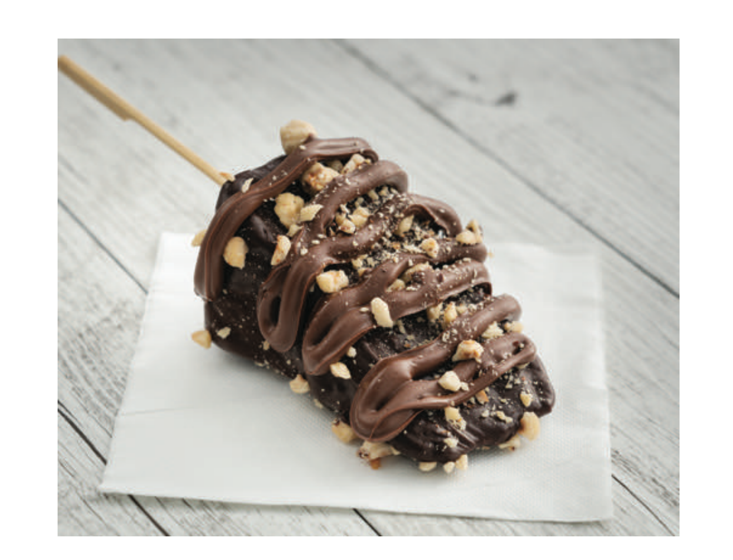
FERRERO STYLE $11.00 DIPPED IN CHOCOLATE GANACHE, ROLLED IN CRUSHED HAZELNUTS & LATHERED IN NUTELLA