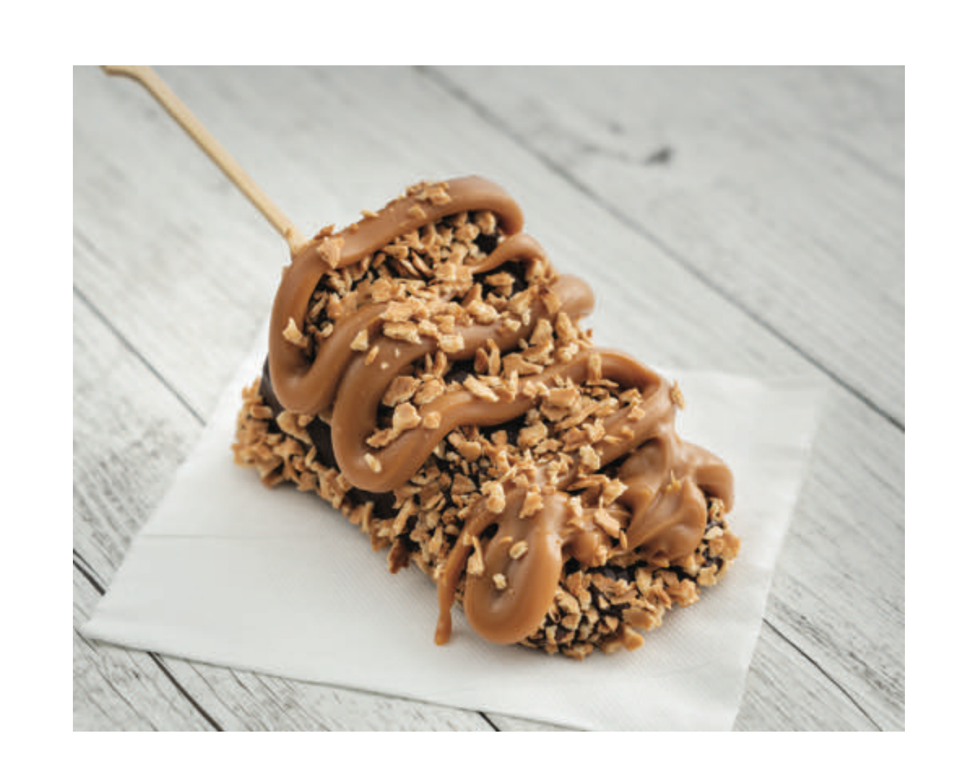
GOLDEN GAYTIME $12.00 DIPPED IN MILK CHOCOLATE GANACHE, ROLLED IN GAYTIME CRUMBS & LAYERED WITH SALTED CARAMEL