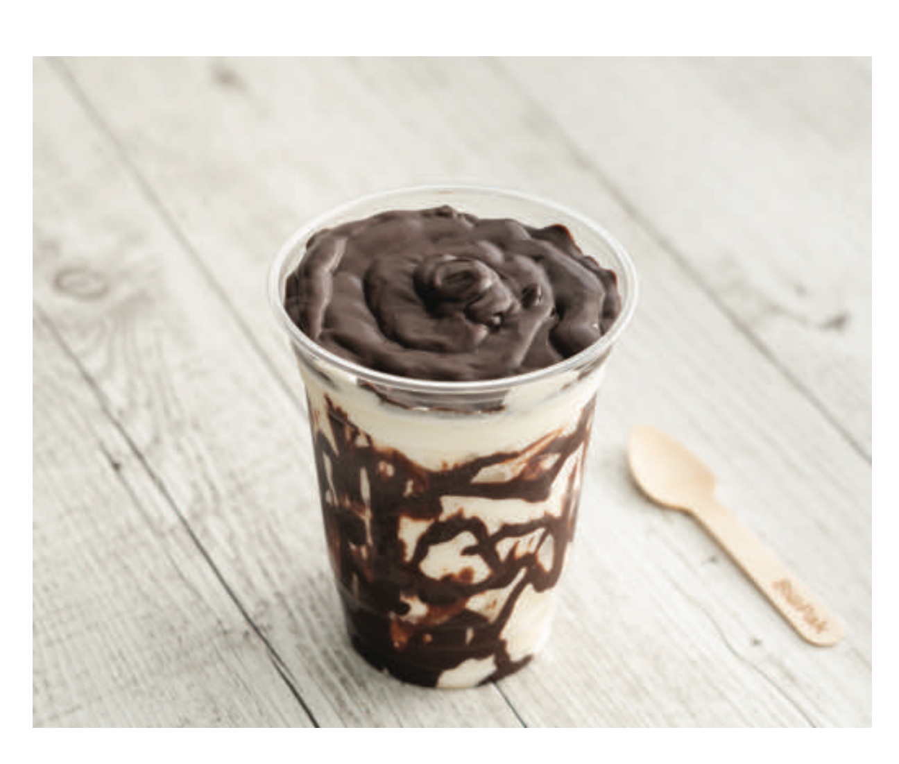
HOT FUDGE SUNDAE $7.00 VANILLA EVEREST ICE-CREAM COVERED IN CHOCOLATE GANACHE