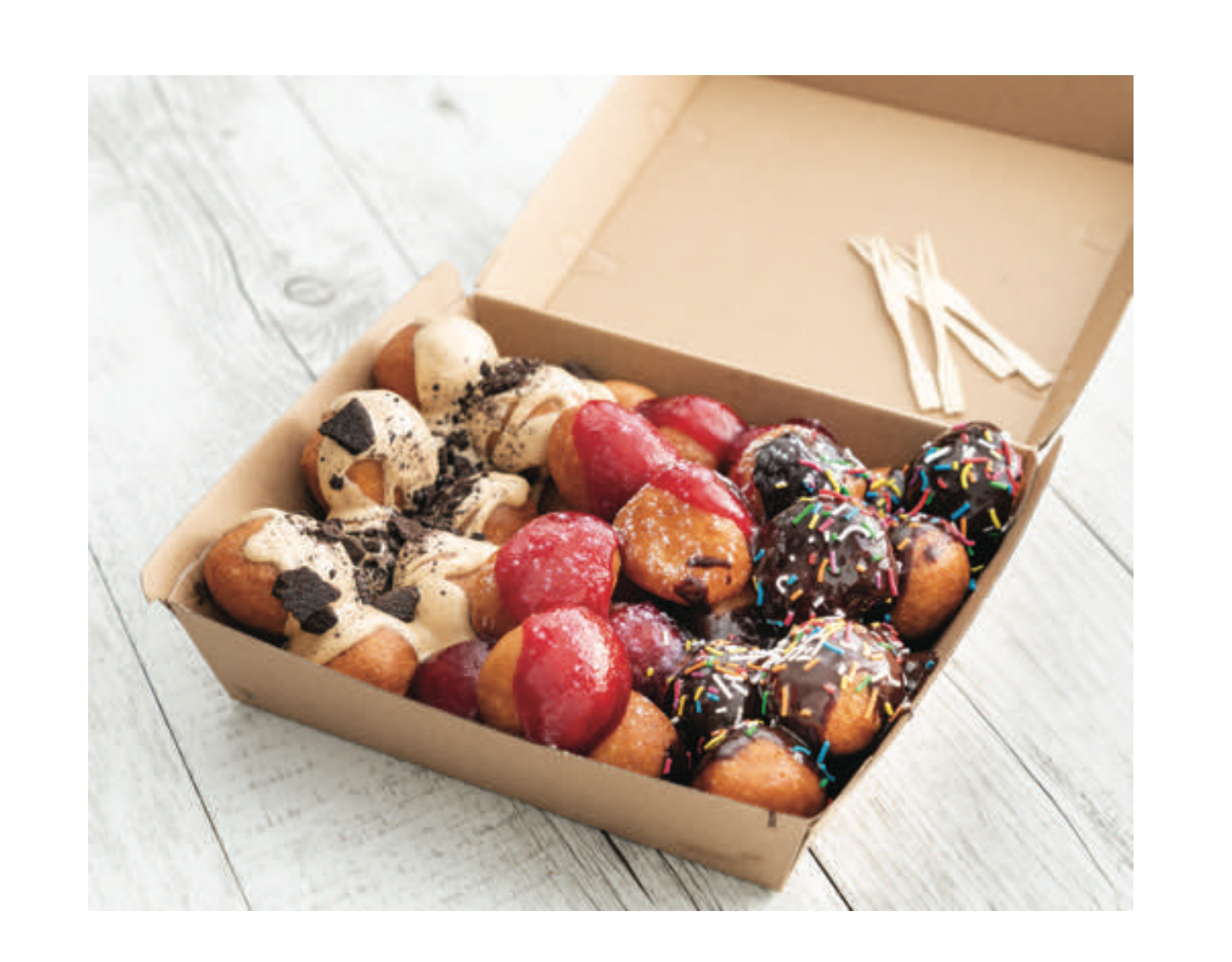
FAMILY JEWELS $19.00 CHOOSE 3 OF OUR DELICIOUS HOT MINI DONUT FLAVOURS. SERVES 2