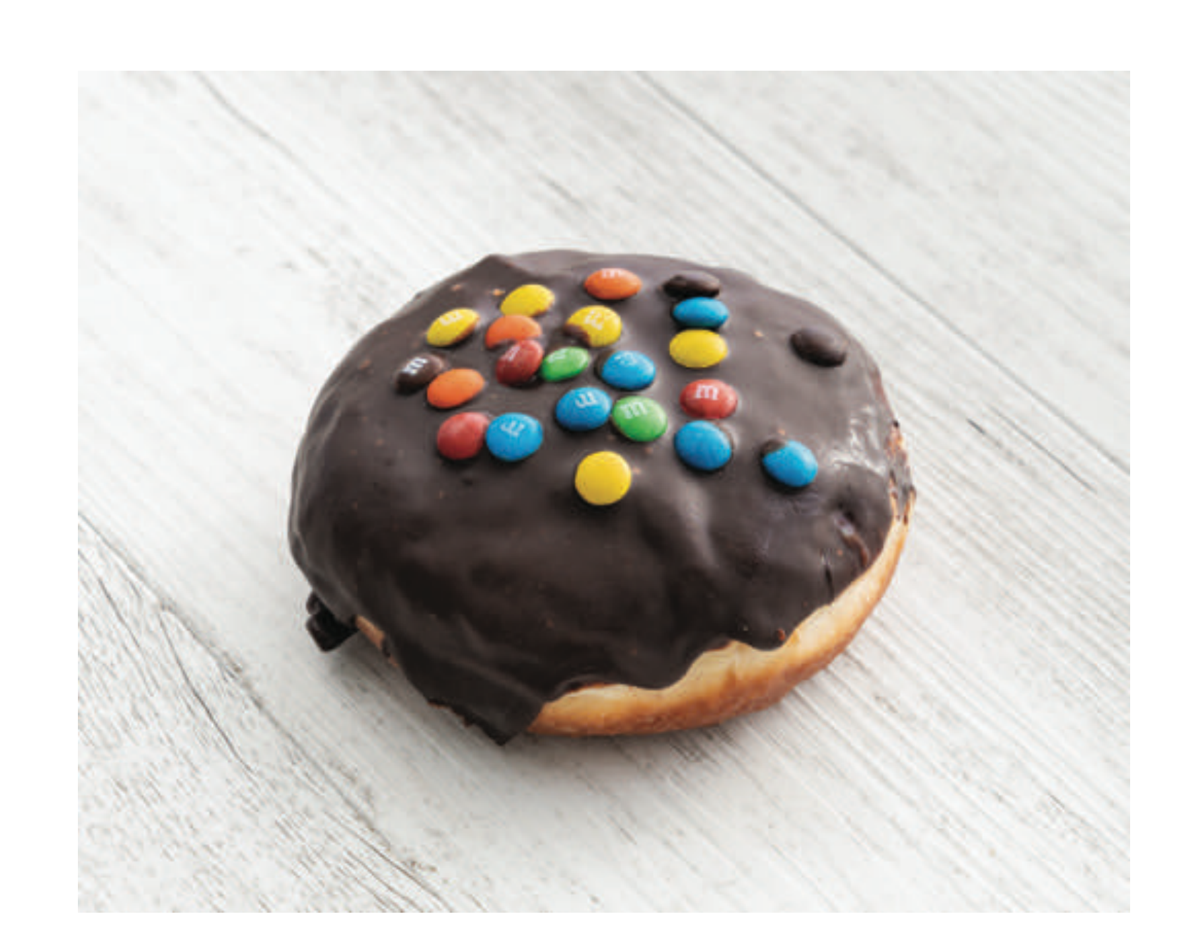
CARAMEL CHOC M&M

PEANUT BUTTER, CHOCOLATE GANACHE & ROASTED PEANUTS