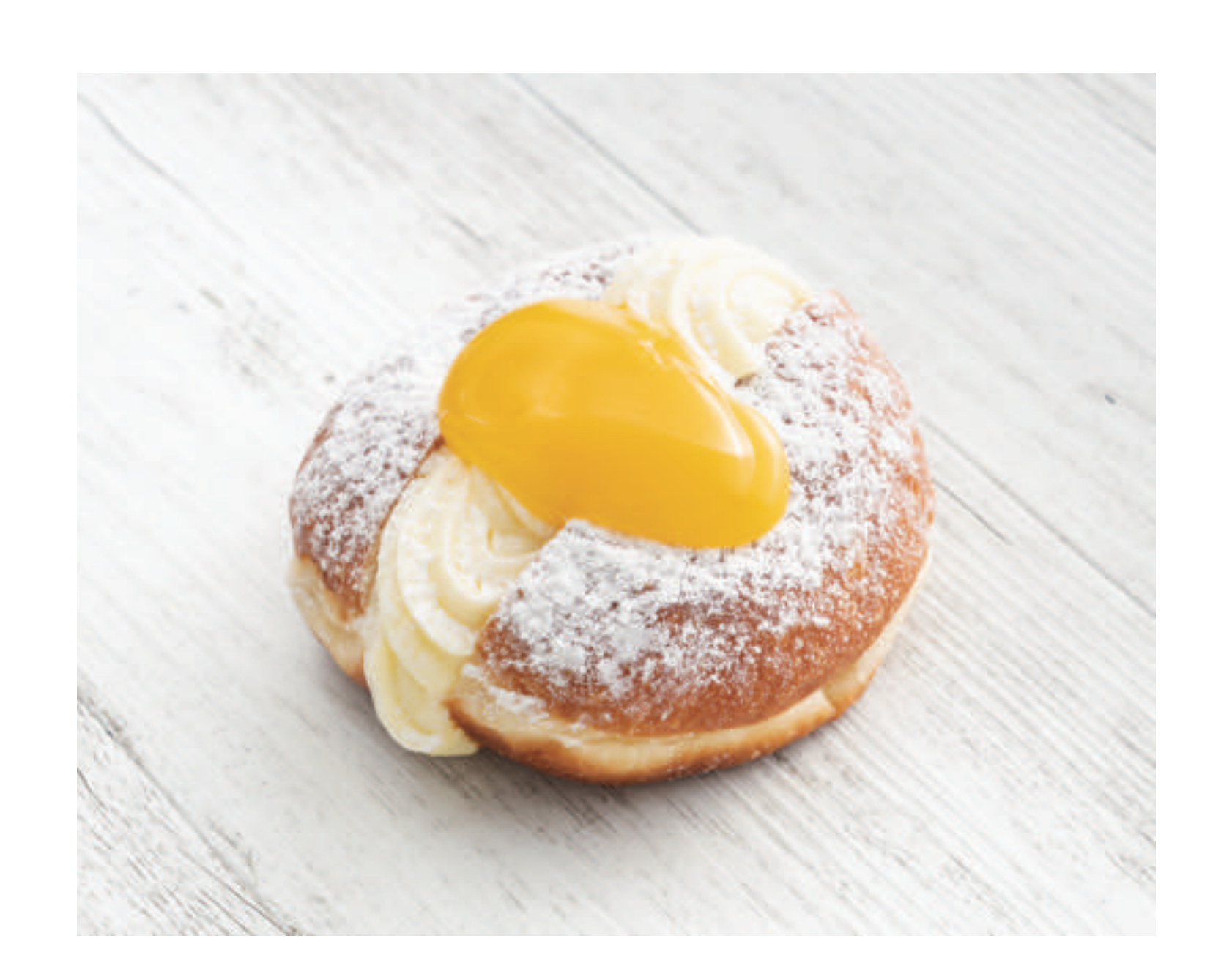
LEMON CHEESECAKE SPLIT

RASPBERRY JAM FILLING, ROLLED IN FINE SUGAR