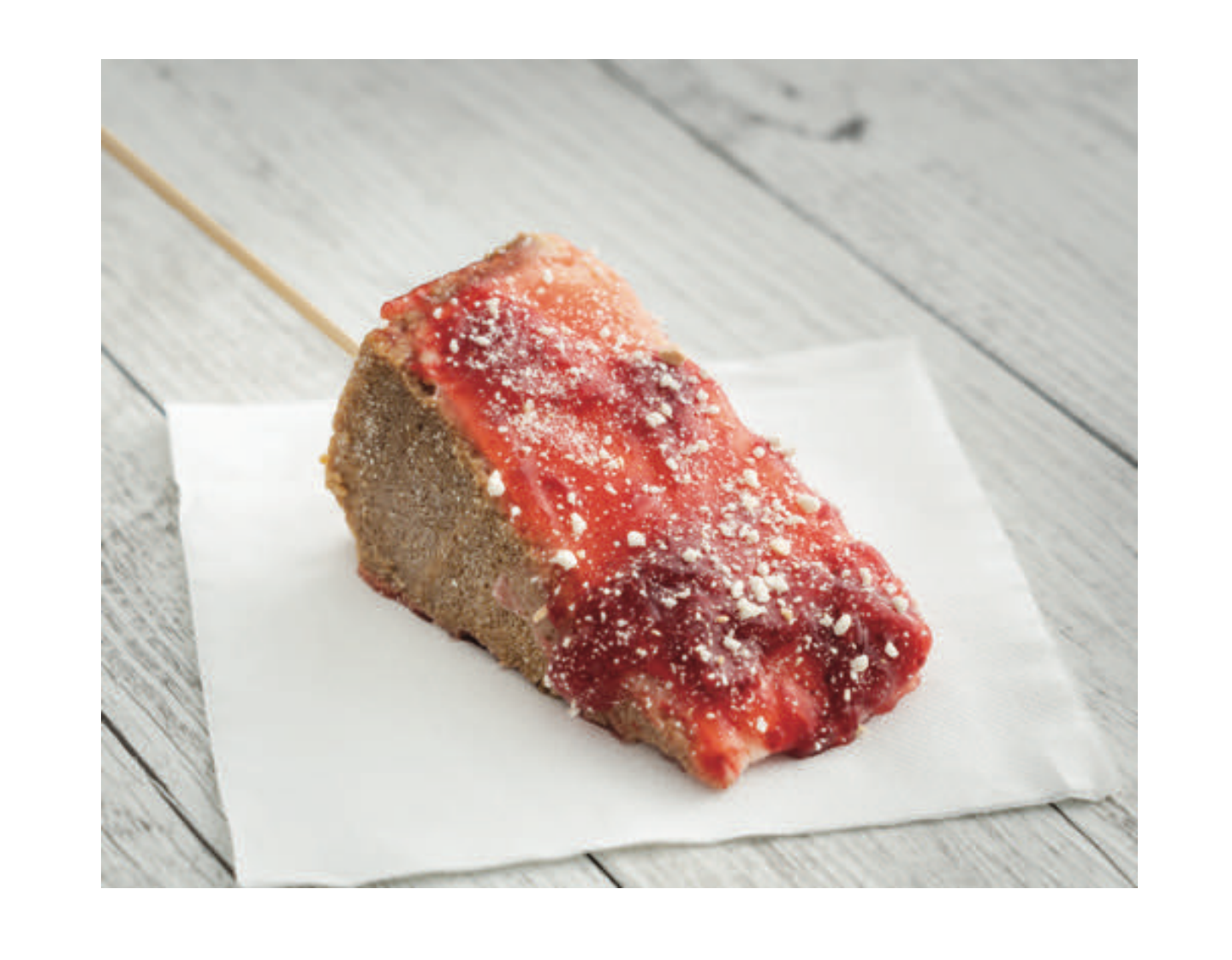
STRAWBERRY $10.00 CLASSIC CREAMY BAKED CHEESECAKE, WITH A BISCUIT BASE. COATED IN HOUSE MADE STRAWBERRY PURÉE