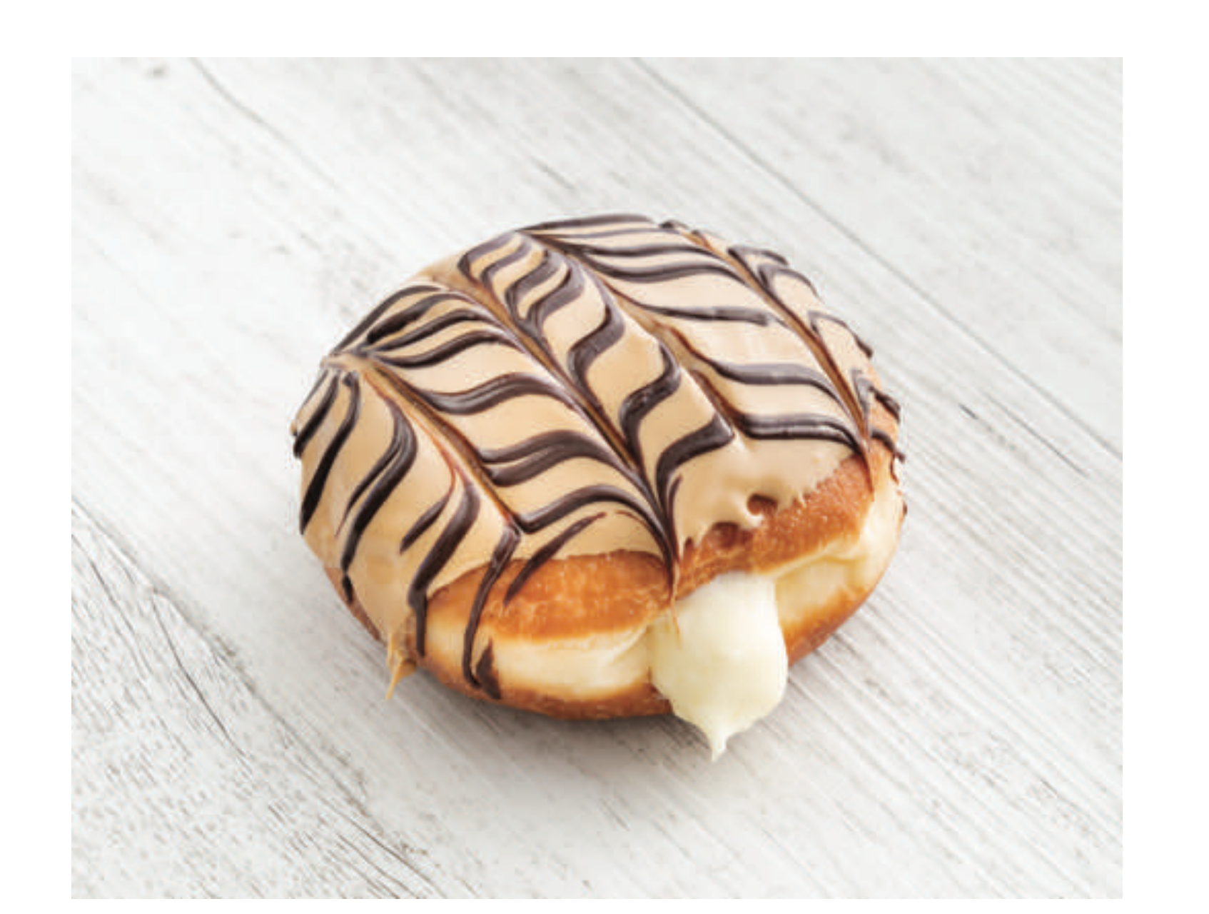
CHEESECAKE SLICE GOLD

FRESH WHIPPED CREAM, DOLLOP OF RASPBERRY JAM & SNOW SUGAR