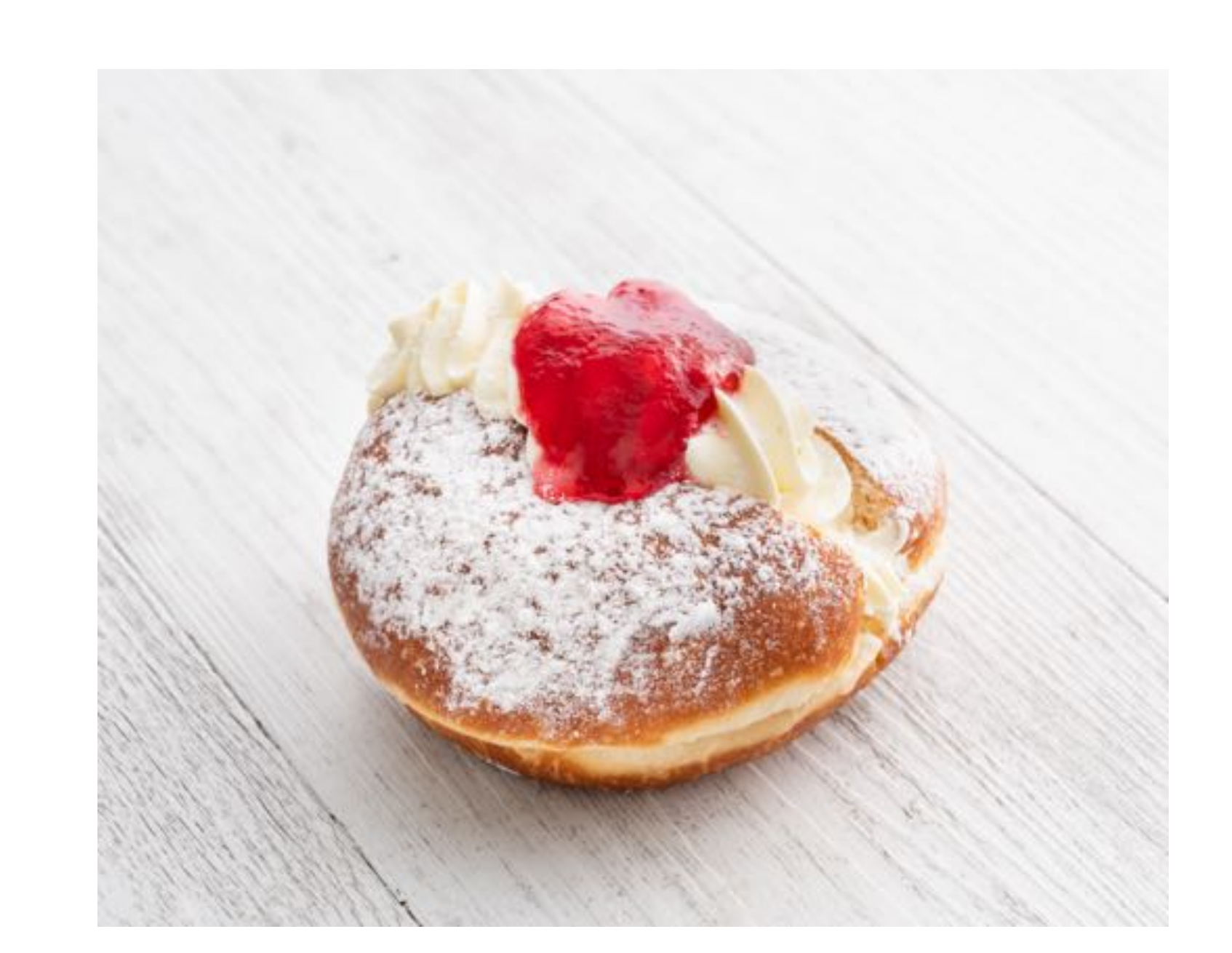
FRESH CREAM & JAM

RASPBERRY JAM FILLING, CHOC GANACHE & DICED COCONUT