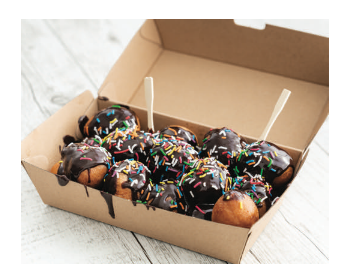
CHOCOLATE SPRINKLE $9.00 HOT CHOC FUDGE DONUTS COVERED IN COLOURFUL SPRINKLES