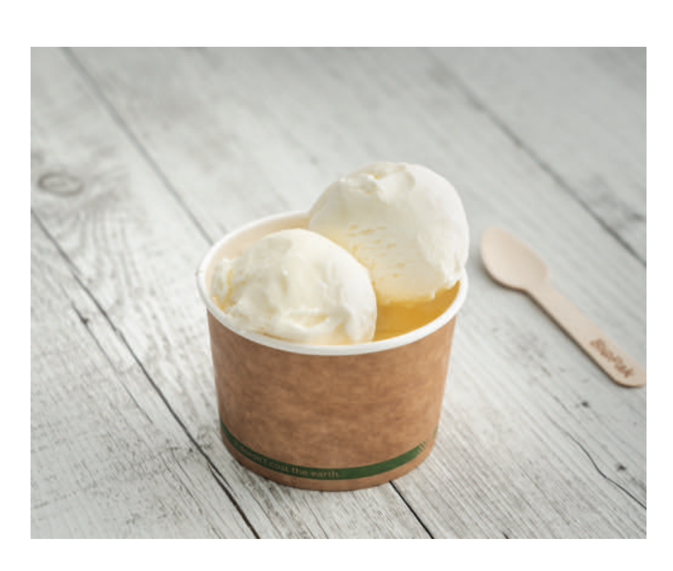
VANILLA ICE-CREAM $4.00 EVEREST VANILLA ICE-CREAM IN A CUTE CUP