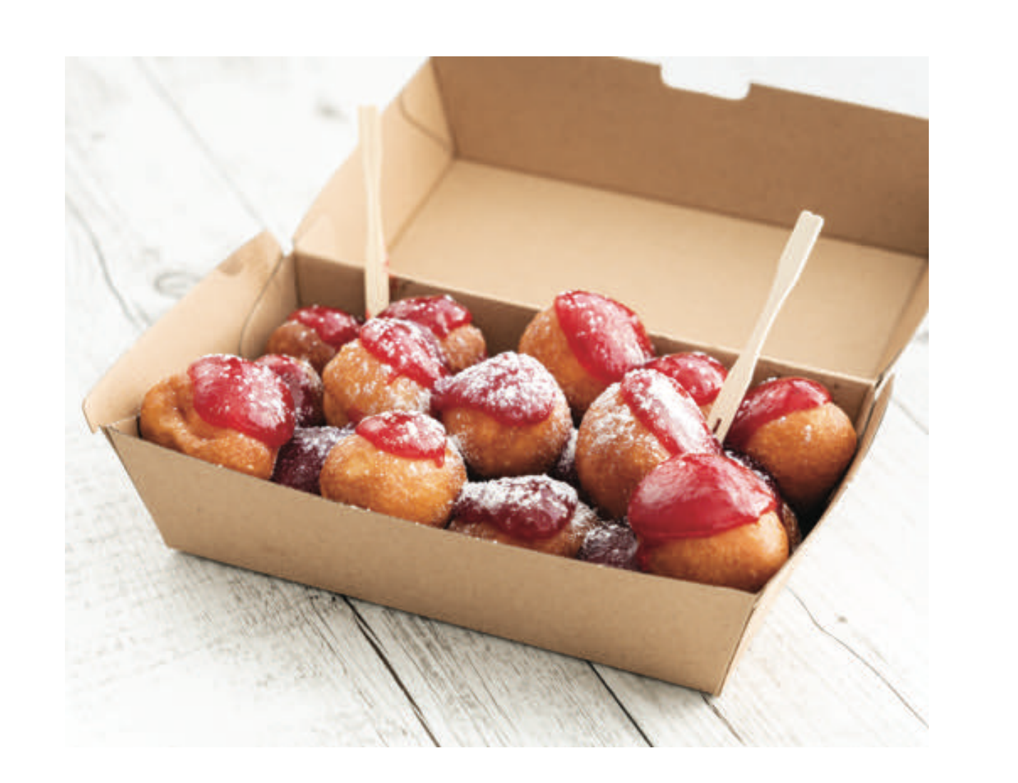
THE JAMMD (V) $9.00 CLASSIC HOT JAM DONUT BALLS