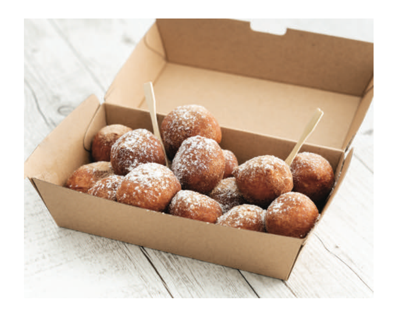
ORIGINAL CIN (V) $9.00 ROLLED IN DUTCH CINNAMON SUGAR, DUSTED WITH ICING SUGAR