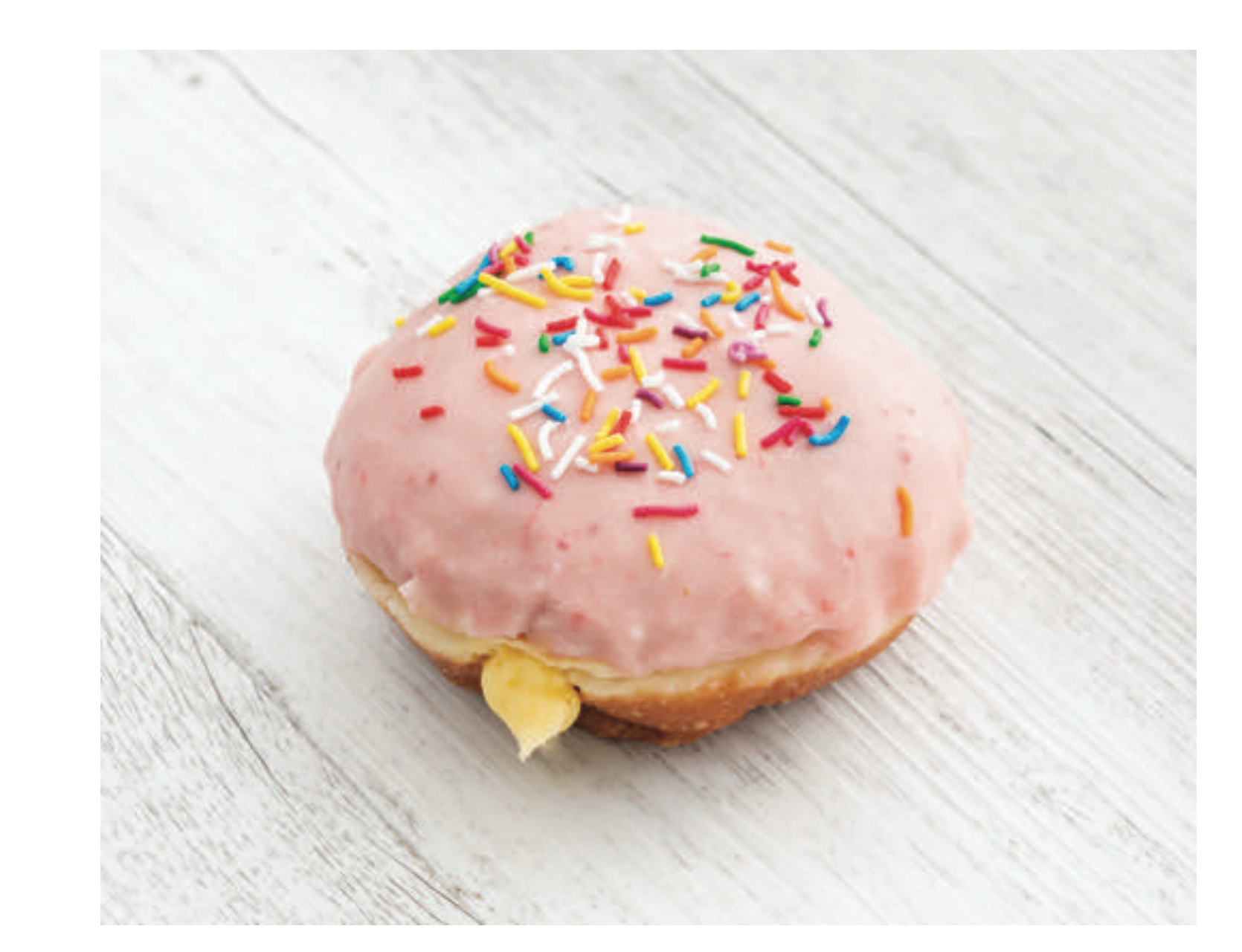
STRAWBERRIES & CREAM

CREAMY CHEESECAKE FILLING, HAND-MADE STRAWBERRY ICING AND BIS- CUIT CRUMBS