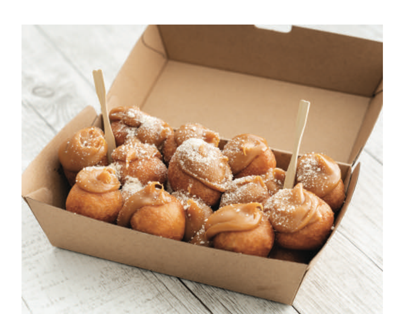
LIFE ON MARS $10.00 COVERED IN LUSCIOUS SALTED CARAMEL & BISCUIT CRUMB.