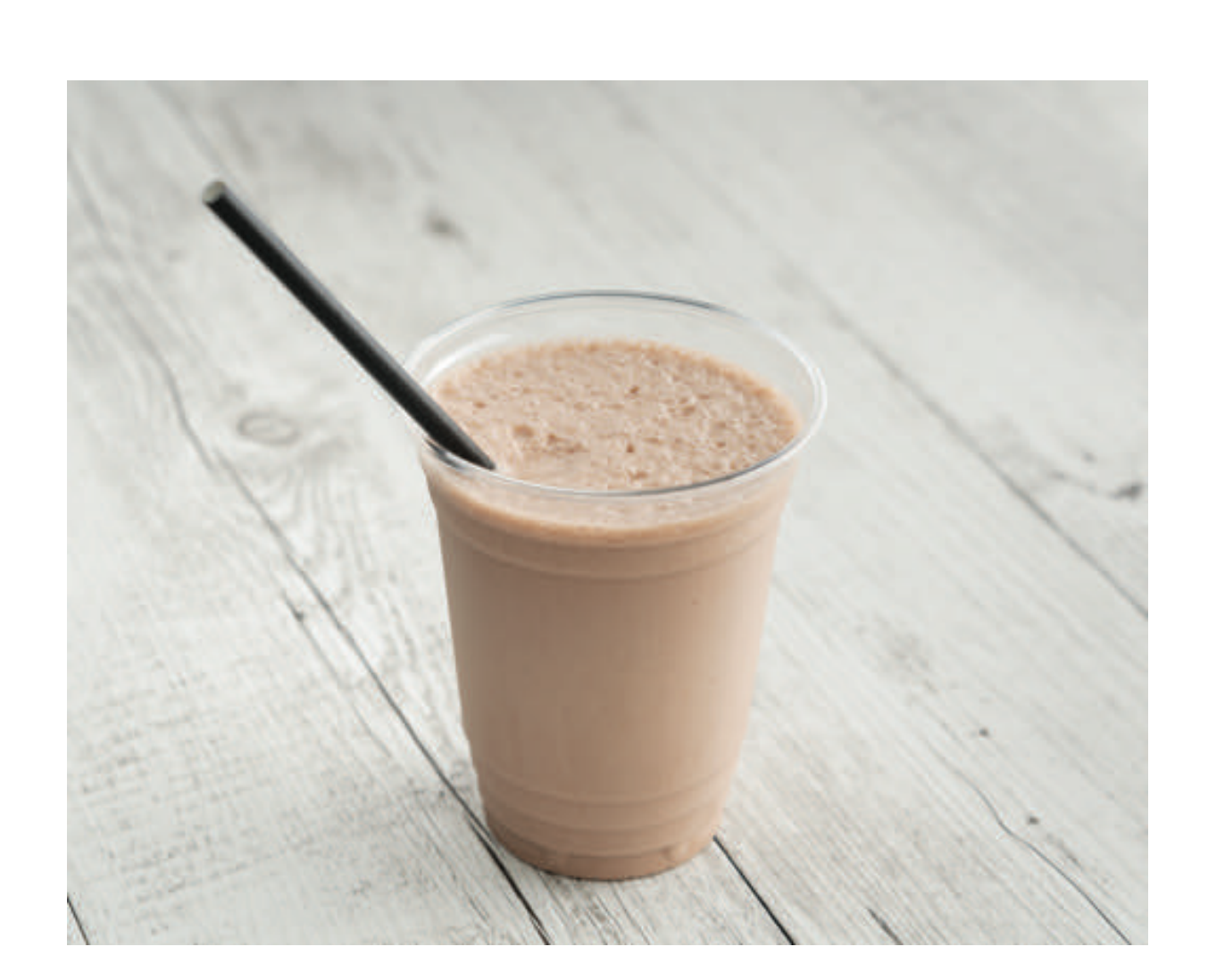
NUTELLA SHAKE $8.50 REAL NUTELLA, BLENDED WITH FULL CREAM MILK & VANILLA ICE-CREAM