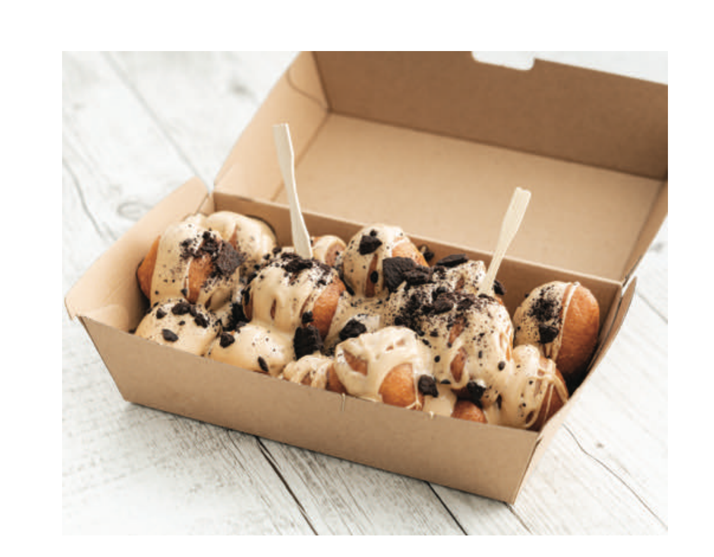
COOKIES & CREAM $11.00 LATHERED IN CALLEBAUT GOLD CHOCOLATE & OREO COOKIE CRUMBS