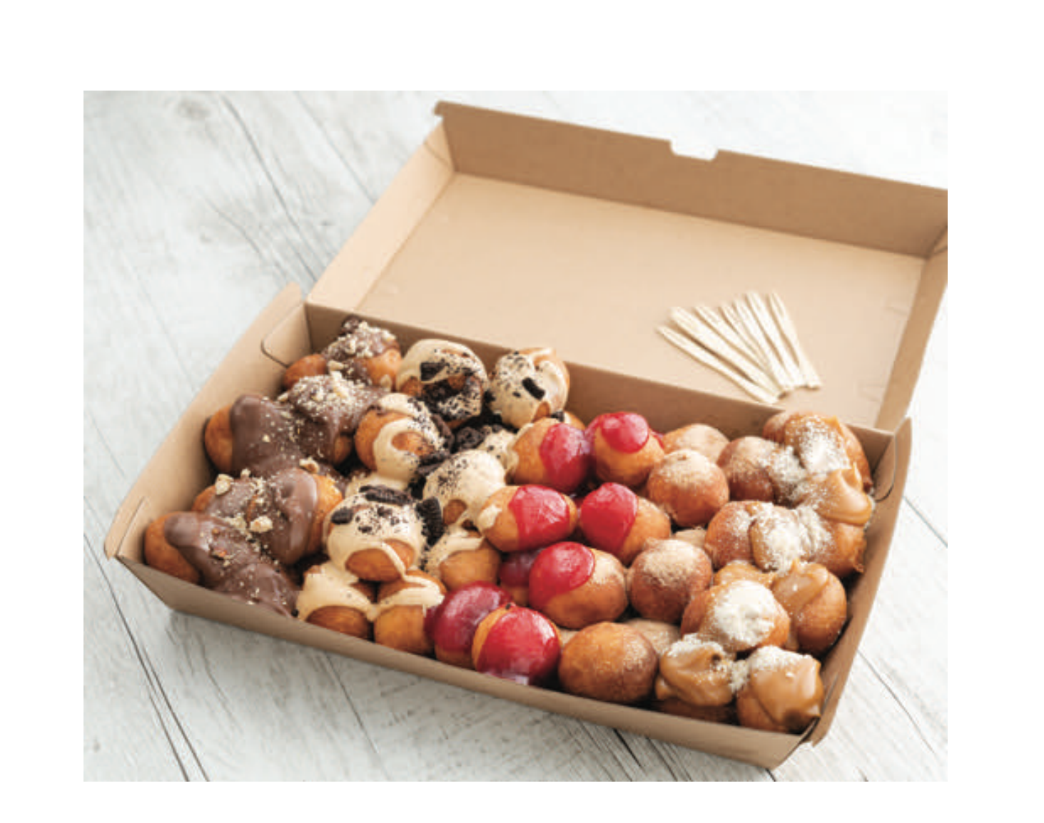
BALLS TO THE WALL $27.00 CHOOSE 5 OF OUR DELICIOUS HOT MINI DONUT FLAVOURS. SERVES 4