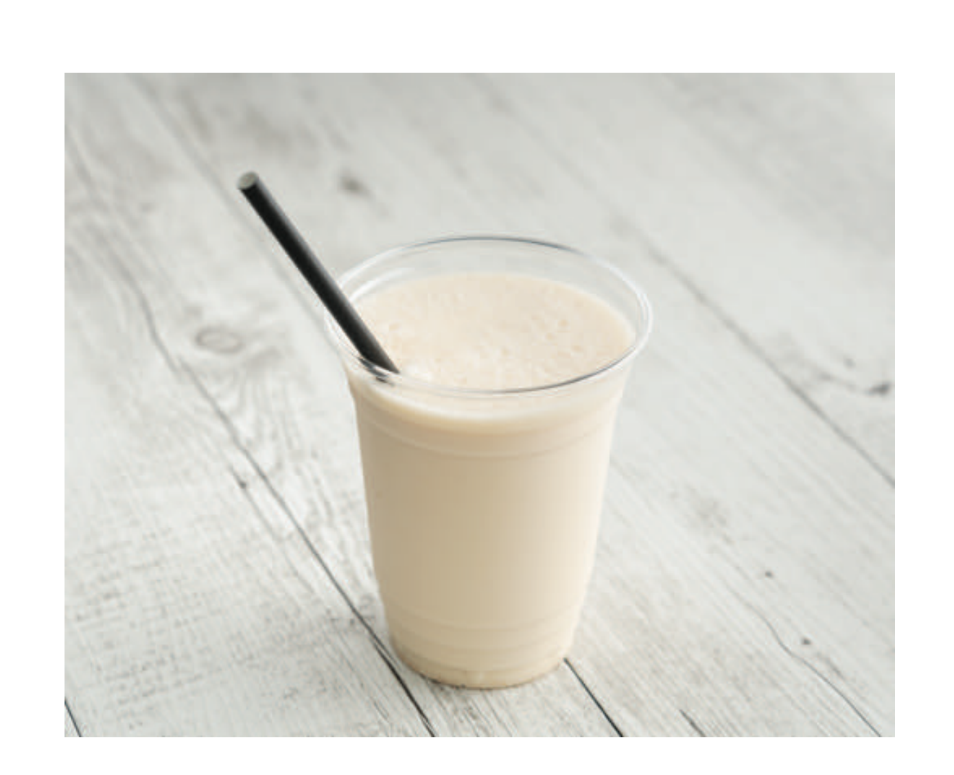
SALTED CARAMEL, BLENDED WITH FULL CREAM MILK & VANILLA ICE-CREAM