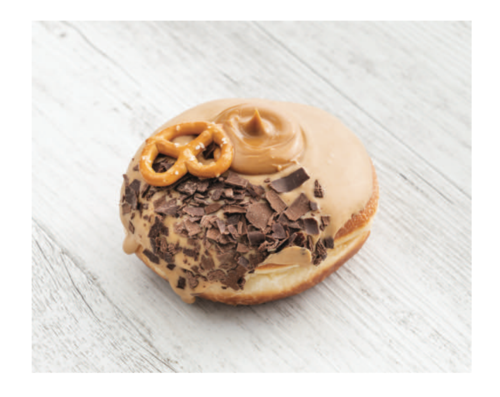
PEANUT BUTTER PRETZEL GOLD

CHEESECAKE FILLING, CARAMELISED WHITE CHOCOLATE GLAZE & CHOCOLATE GANACHE LINEWORK