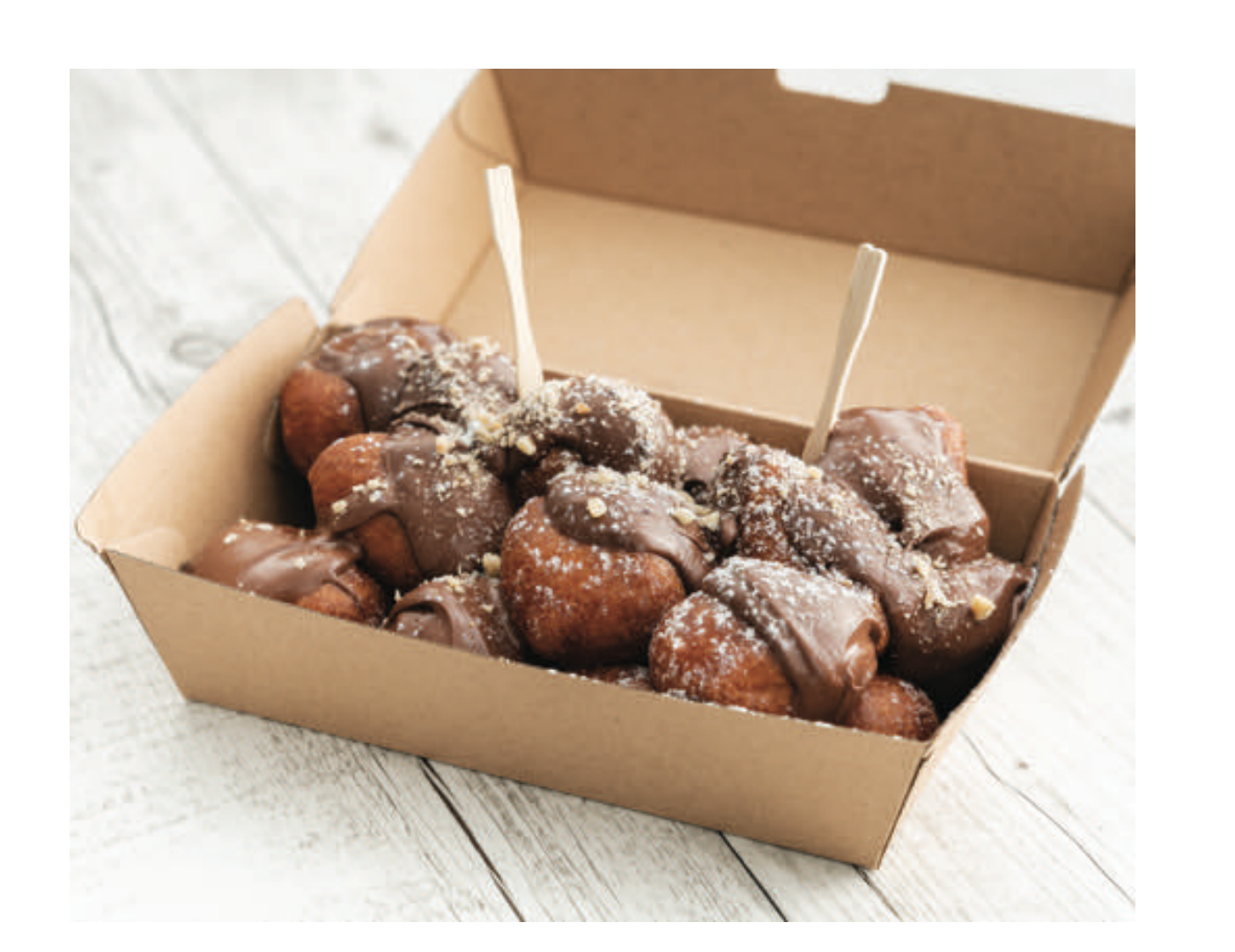
BUST A NUTELLA $11.00 COVERED IN HOT NUTELLA & CRUSHED ROASTED HAZELNUTS