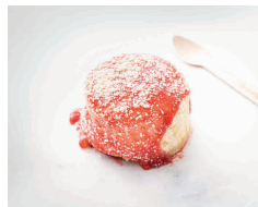
STRAWBERRY $8.00 OUR CLASSIC CREAMY BAKED CHEESECAKE, COATED IN OUR STRAWBERRY PURÉE