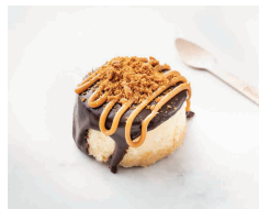
GOLDEN GAYTIME $9.00 COATED IN CHOC GANACHE, DRIZZLES OF LUSCIOUS SALTED CARAMEL & BUTTERNUT COOKIE CRUMBLE