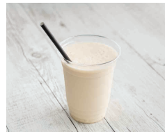
SALTED CARAMEL $8.50 SALTED CARAMEL, BLENDED WITH FULL CREAM MILK & VANILLA ICE-CREAM