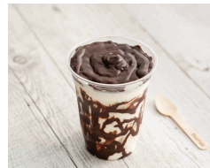
HOT FUDGE SUNDAE $6.00 CREAMY VANILLA BULLA ICE-CREAM COVERED IN WARM CHOCOLATE GANACHE