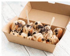
COOKIES & CARAMILK $10.00 COATED IN WARM MELTED CALLEBAUT GOLD CHOCOLATE & OREO COOKIE CRUMBS