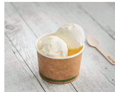
VANILLA ICE-CREAM $4.00 CREAMY BULLA VANILLA ICE-CREAM IN A CUP