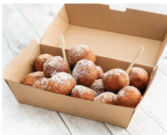
ORIGINAL CIN (V) $7.00 HOT ROLLED IN DUTCH CINNAMON SUGAR, DUSTED WITH SNOW SUGAR