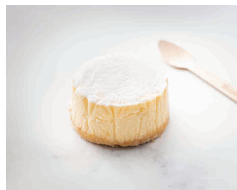
NEW YORK STYLE $7 OUR CLASSIC CREAMY BAKED CHEESECAKE WITH A CRUNCHY BISCUIT CRUMB