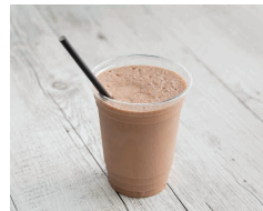
CHOCOLATE FUDGE $8.50 CHOCOLATE GANACHE BLENDED WITH FULL CREAM MILK & ICE-CREAM