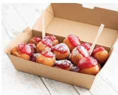
THE JAMMD (V) $8.00 HOT JAM DONUT BALLS WITH A CLASSIC JAM FILLING