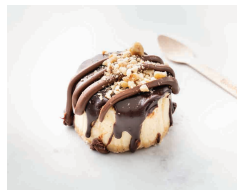
FERRERO STYLE $9.00 DRIZZLES OF WARM CHOCOLATE GANACH, NUTELLA & CRUNCHY ROASTED HAZELNUTS