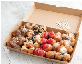
BALLS TO THE WALL $27.00 CHOOSE 4 OF OUR DELICIOUS HOT DOUGH BITE FLAVOURS. SERVES 4