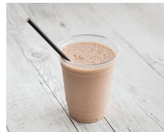
NUTELLA SHAKE $8.50 REAL NUTELLA, BLENDED WITH FULL CREAM MILK & VANILLA ICE-CREAM