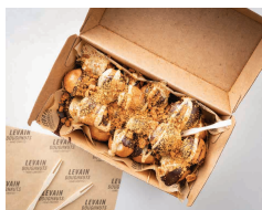
LIFE ON MARS $10.00 COVERED IN LUSCIOUS SALTED CARAMEL, SMOOTH BISCOFF SPREAD & BUTTERNUT BISCUIT CRUMBS